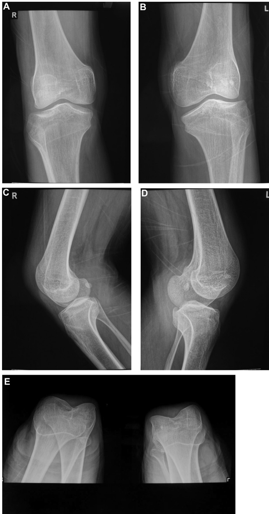
Fig. 3. Anteroposterior (A,B), lateral (C,D) and tunnel (E) radiographs of bilateral absence of the patella.