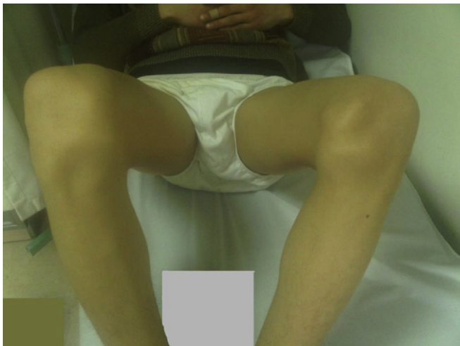
Fig. 1. Clinical picture showing more prominent medial femoral than lateral femoral condyles.

Onycho-osteodysplasia (NPS) is transmitted as a simple autosomal dominant gene. There is a definite linkage between the locus of the nail–patella gene and the ABO blood groups. 1,4,5 Thus, we